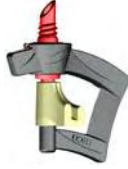
INVERTED Red Base