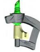
INVERTED Green Base